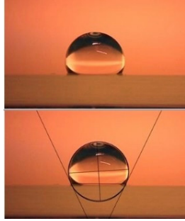
2.0% polymer on glass Water contact angle: 113.3°